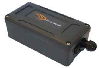
BW-AR Active repeater to extend wireless range or coverage