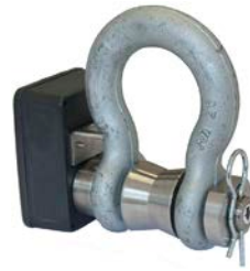
BW-S325 & BW-S475 Shackles BroadWeigh wireless Crosby Safety Bow Shackles