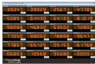
BW-LOG100 Free data logging software package for advanced monitoring up to 100 channels