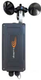
BW-WSS Wireless wind speed sensor