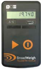
BW-HR Handheld Wireless Display LCD reading from an unlimited number of BroadWeigh shackles