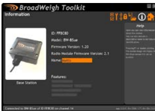
BW-Toolkit Software used to calibrate and configure your devices