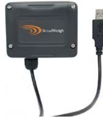
BW-BSue Extended range wireless radio telemetry USB Base Station