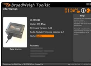
BW-Toolkit Software used to calibrate and configure your devices